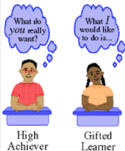
Response to an assignment