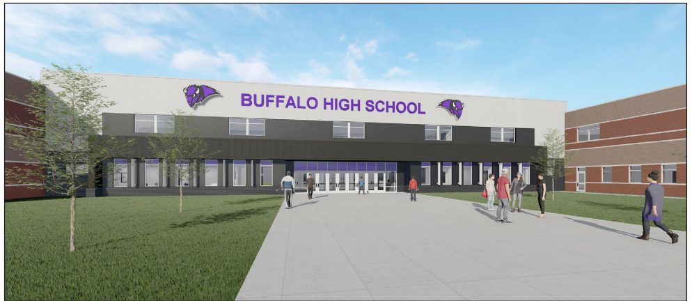
This is an architect's rendering of the new secure entrance at Buffalo High School. Construction will start during Spring Break.

A separate construction project to create a new vestibule at Discovery Elementary's Door #6 will address a