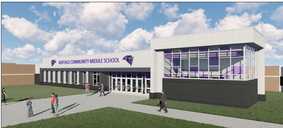
This architectural drawing shows the new secure entrance for Buffalo Community Middle School. Construction is expected to start in April.

Our consultants from RA Morton have been pleased with the level of contractor interest, and with the quality of the contractors who have submitted bids. We are looking forward to the improvements in security, building integrity and efficiency that these projects will provide, and thank our BHM community members for their support!