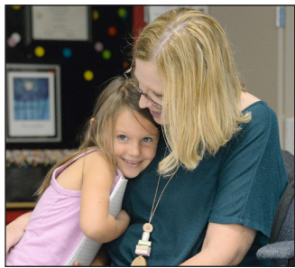
Sign up for kindergarten on Feb. 13. See more information on Page 2.