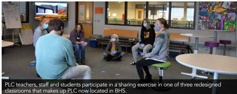
PLC teachers, staff and students participate in a sharing exercise in one of three redesigned classrooms that makes up PLC now located in BHS.

PLC programming centers around the idea that ALL students can learn, and when learning challenges arise, a more individualized personal learning approach is taken